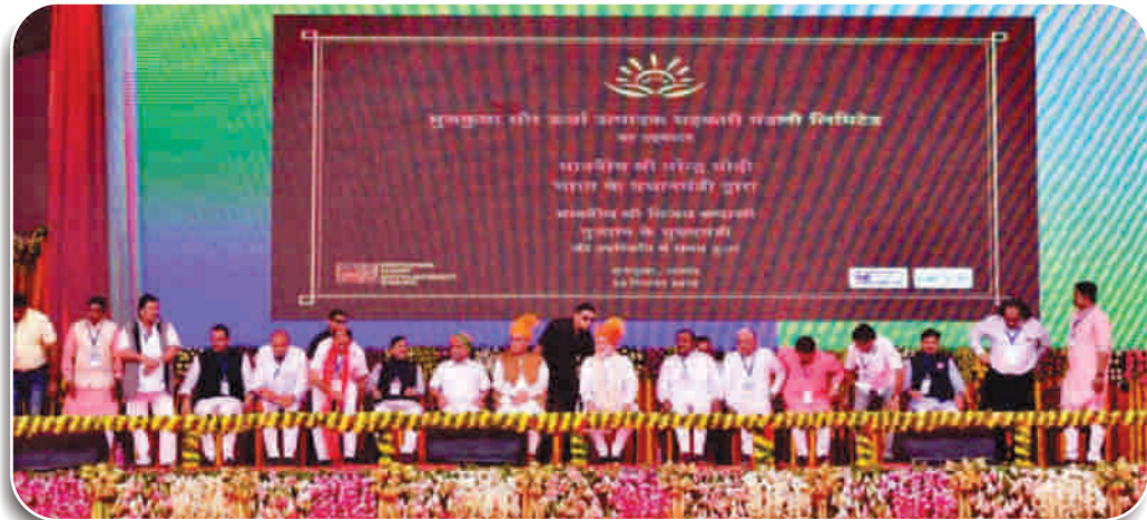
Hon'ble Prime Minister, Shri Narendra Modi inaugurating the project on 30.09.2018 at Gujarat