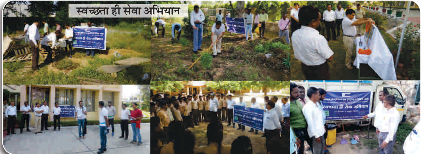
स्वच्छता ही सेवा अभियान