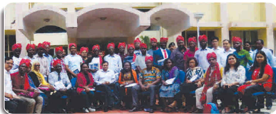
Team of Master Trainers from ISA Member Countries at REIL on 22.09.2018

These master trainers will go back and train more people in their home country to promote the solar industry, employment & investments to achieve the objective of International Solar Alliance (ISA).