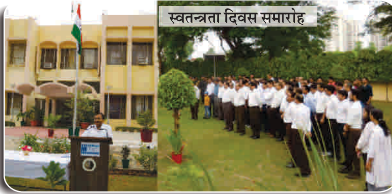
स्वतन्त्रता दिवस समारोह