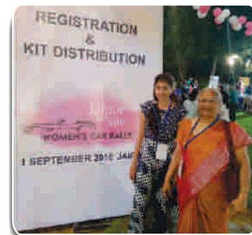
REIL's employees actively took part in Jaipur by Nite Marathon on 25.08.2018 & in Women's Car Rally on 01.09.2018.