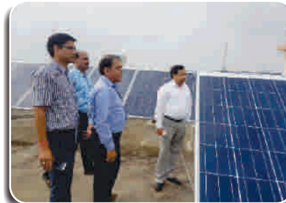
Visit to SPV power plants at Kota Technical University

University further plans to install 1MW SPV Power plant at its campus.