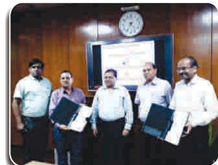
MoU signing between REIL and JMRCL for EV Charging stations

REIL signed an agreement with Jaipur Metro Rail Corporation, Jaipur (JMRCL) for supply and installation of Electric Vehicle (EV) Charging Stations. The agreement was signed by General Manager (Technical), REIL and Executive Director (Ops) JMRCL in gracious presence of MD REIL and other senior officers.